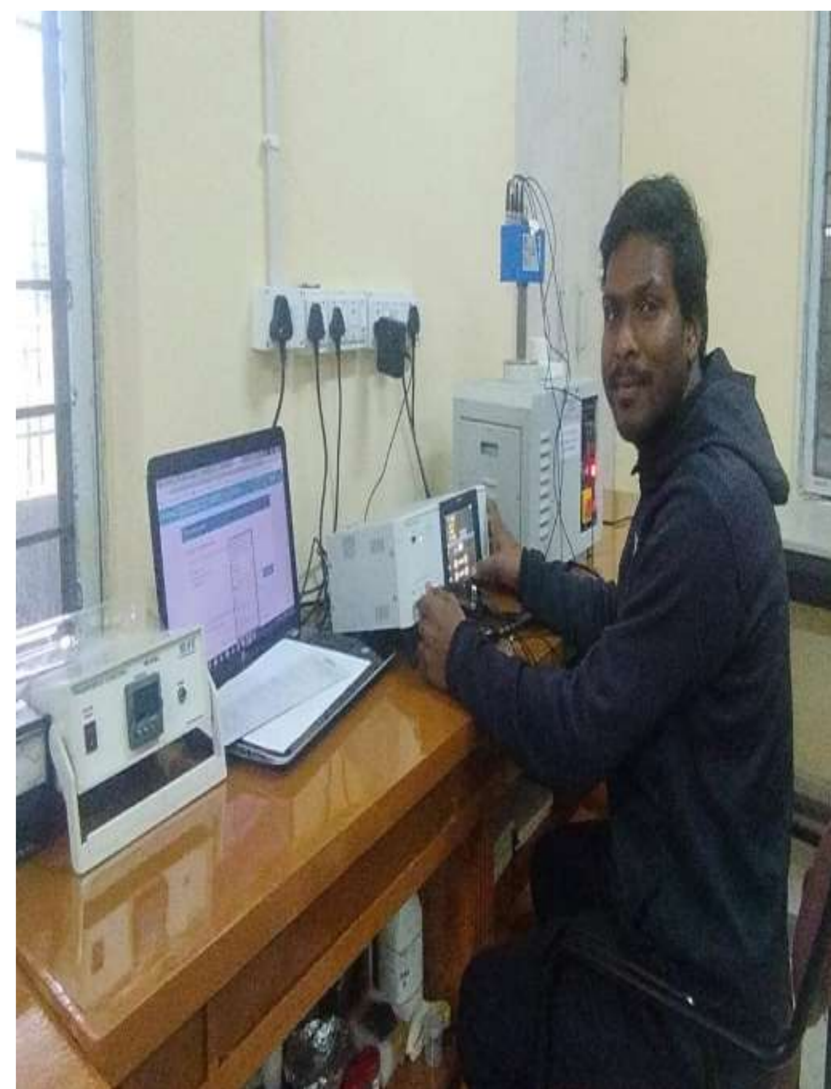
Dielectric measurement Set-up