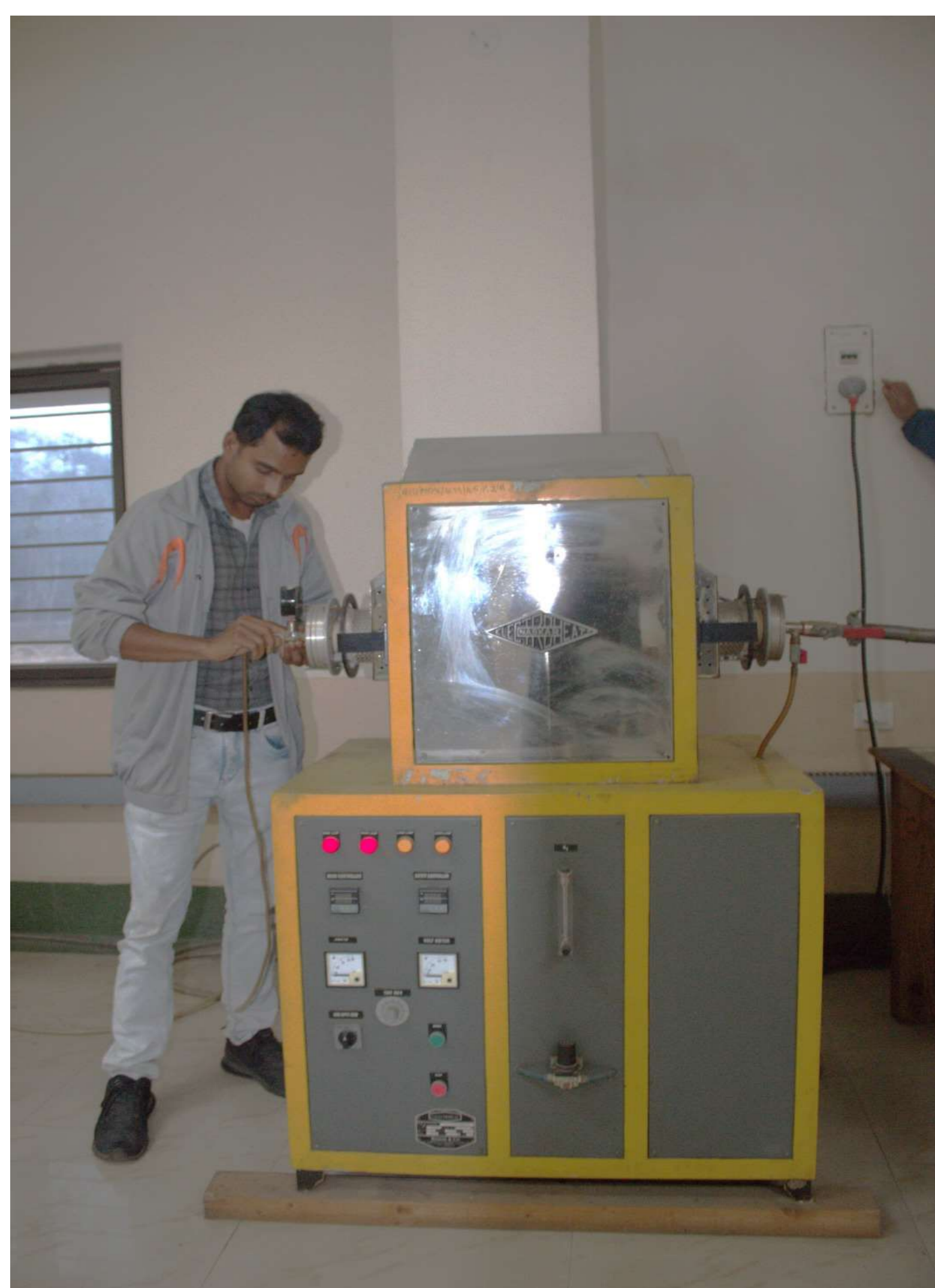
High Temp Furnace