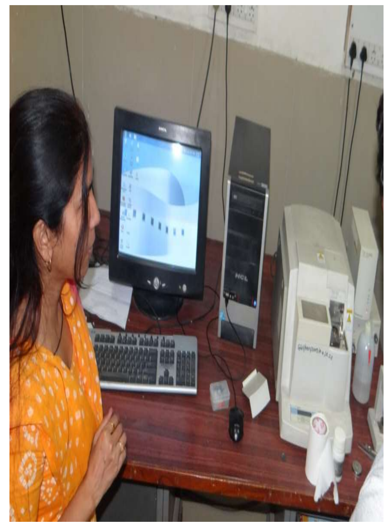
DSC and TGA