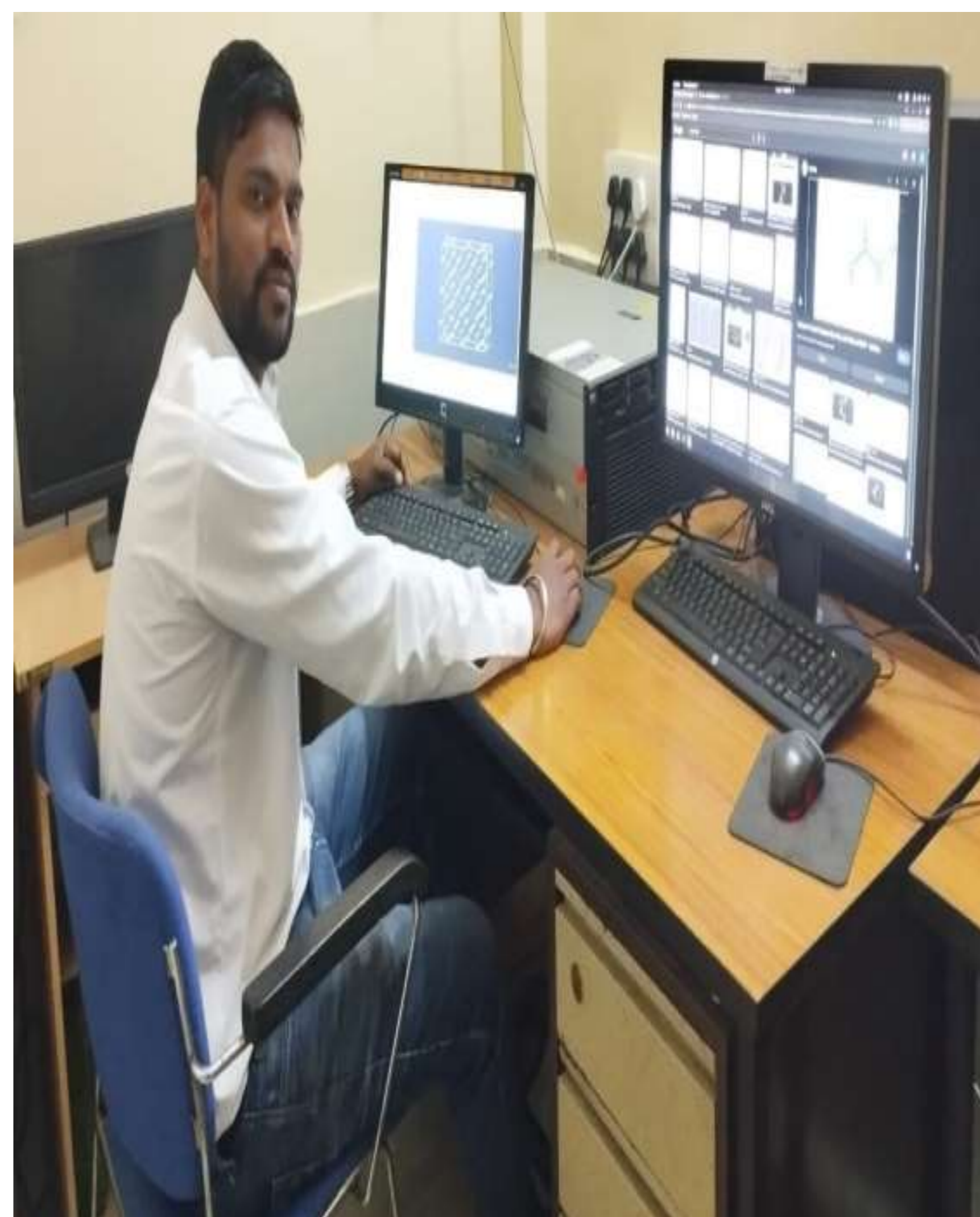
Computational Physics Lab