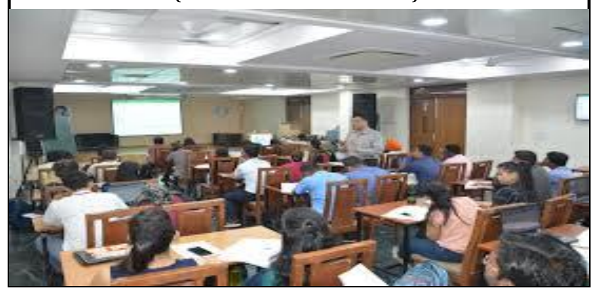
Participants of the event