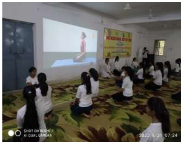
At Raj Mohini Devi Girls Hostel