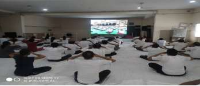
At inside of Rajat Jayanti Sabhagar