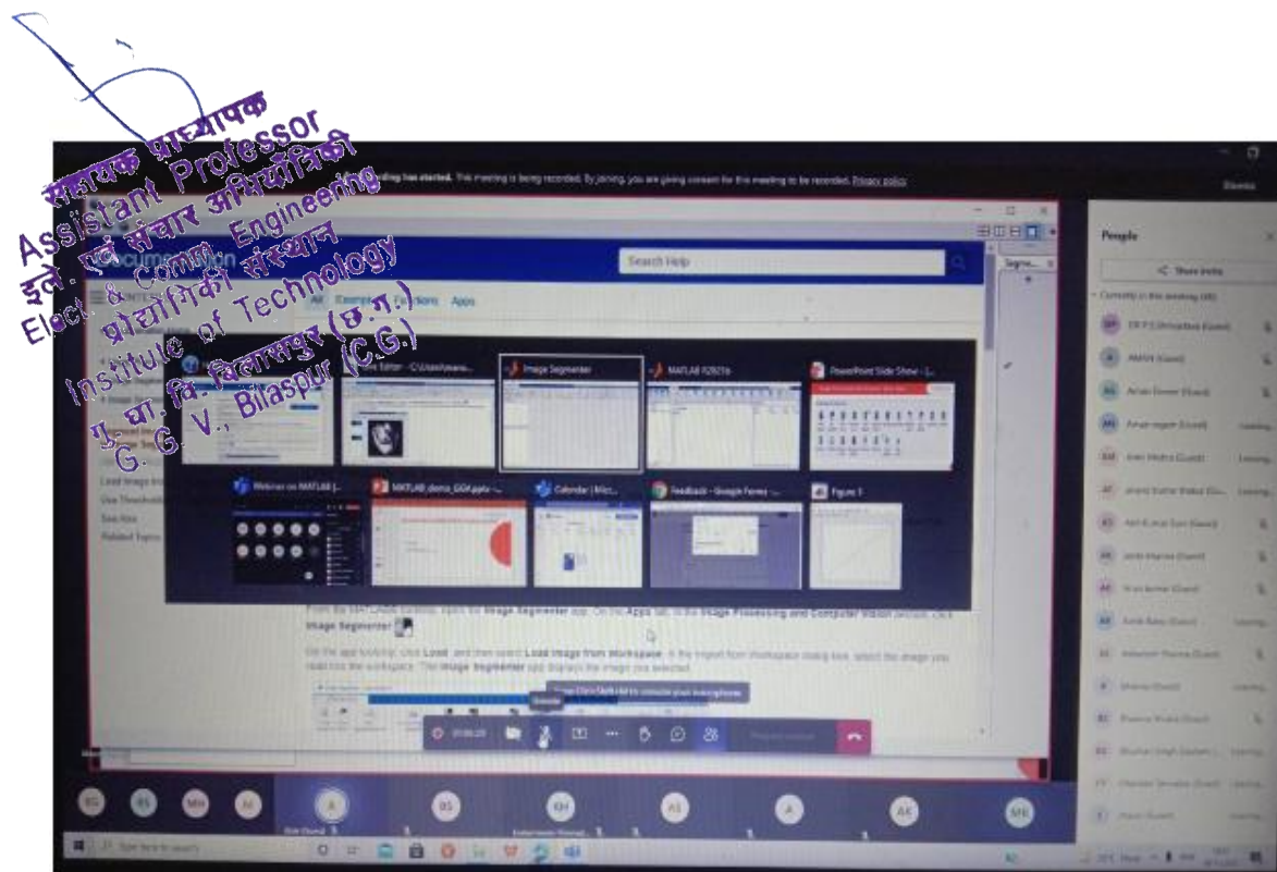
<Resource Person explaining the contents on 16/11/2021>