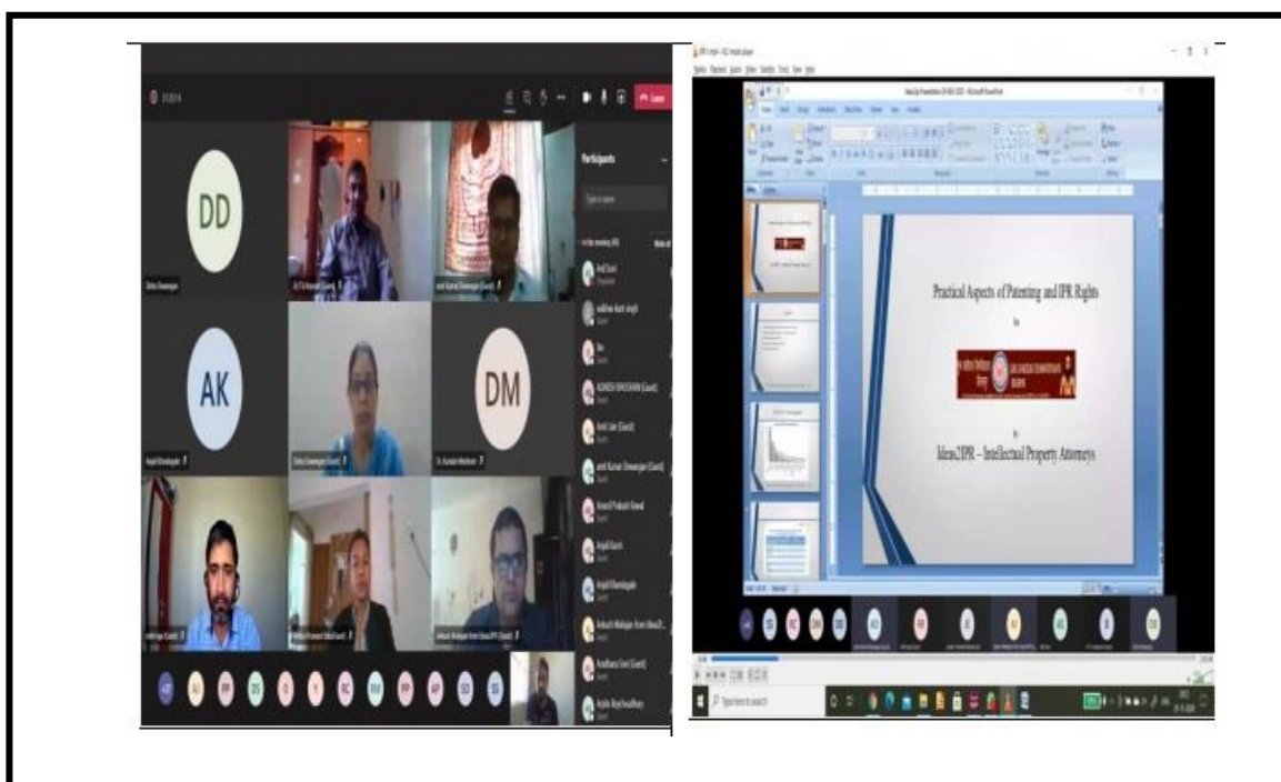
<Participants attending workshop on “Intellectual Property Rights”>