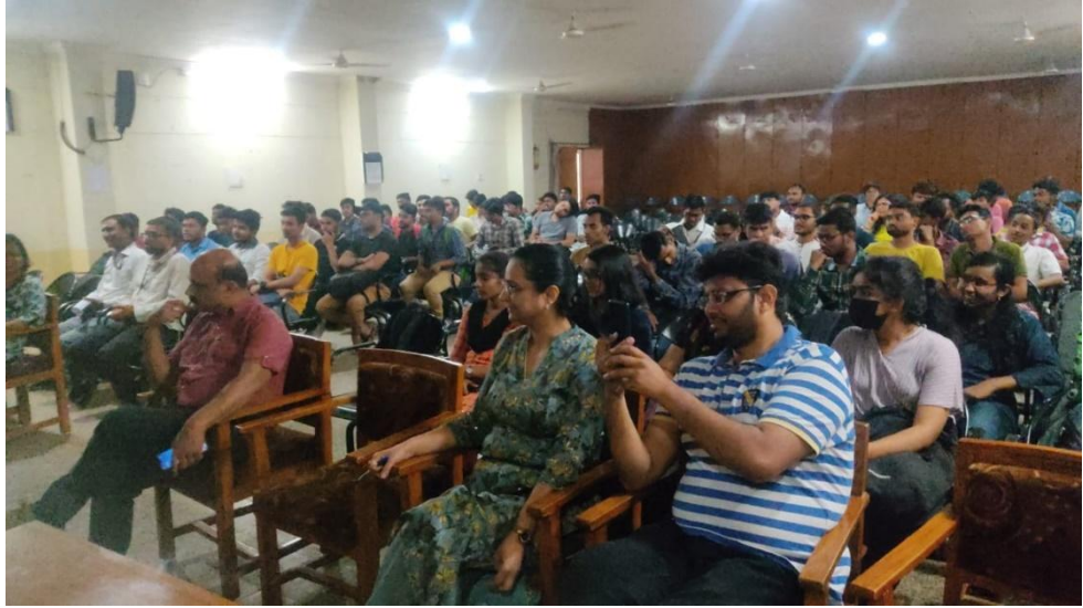
Approx 200 Students Attended the Lecture on 13-03-2023