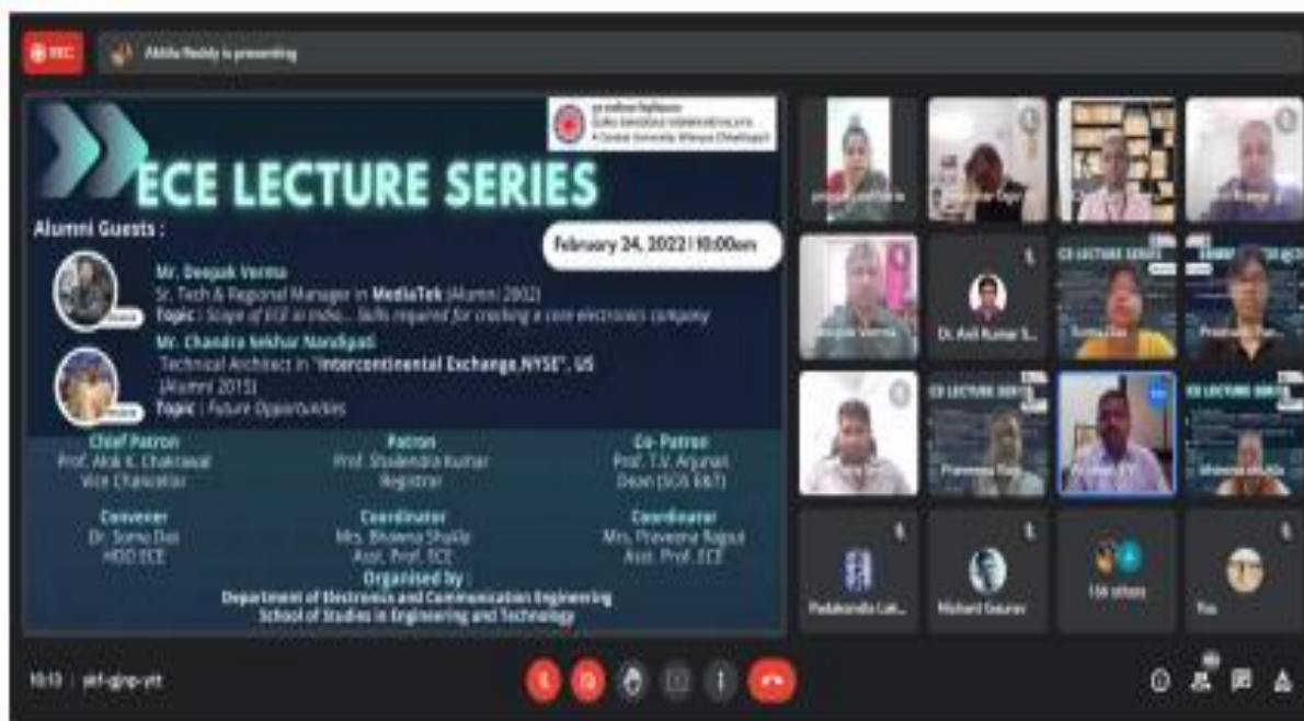
<Inaugural Session of ECE Lecture Series on 24-02-2022 >