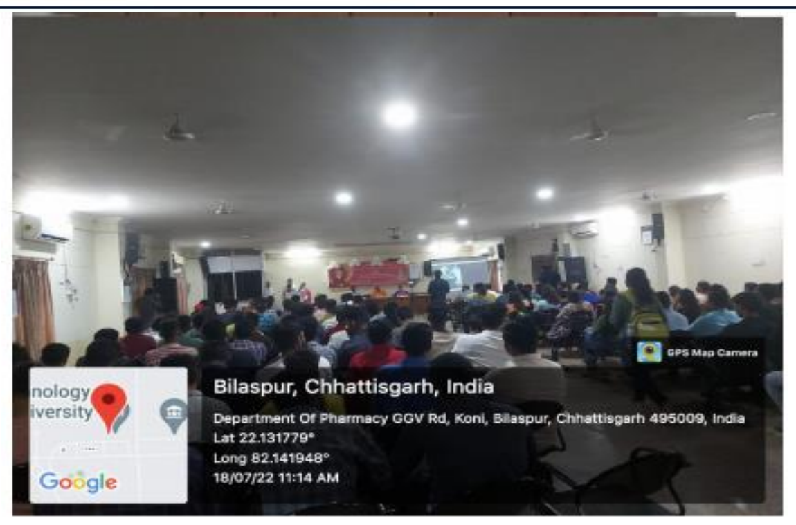
< Students attending Lecture series on 18/07/2022>