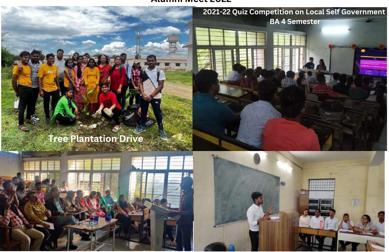
Speech Competition organized on the Constitution Day