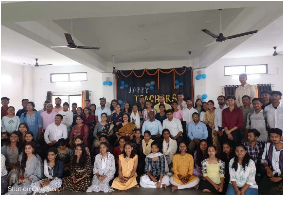
Teachers Day Celebration 2023