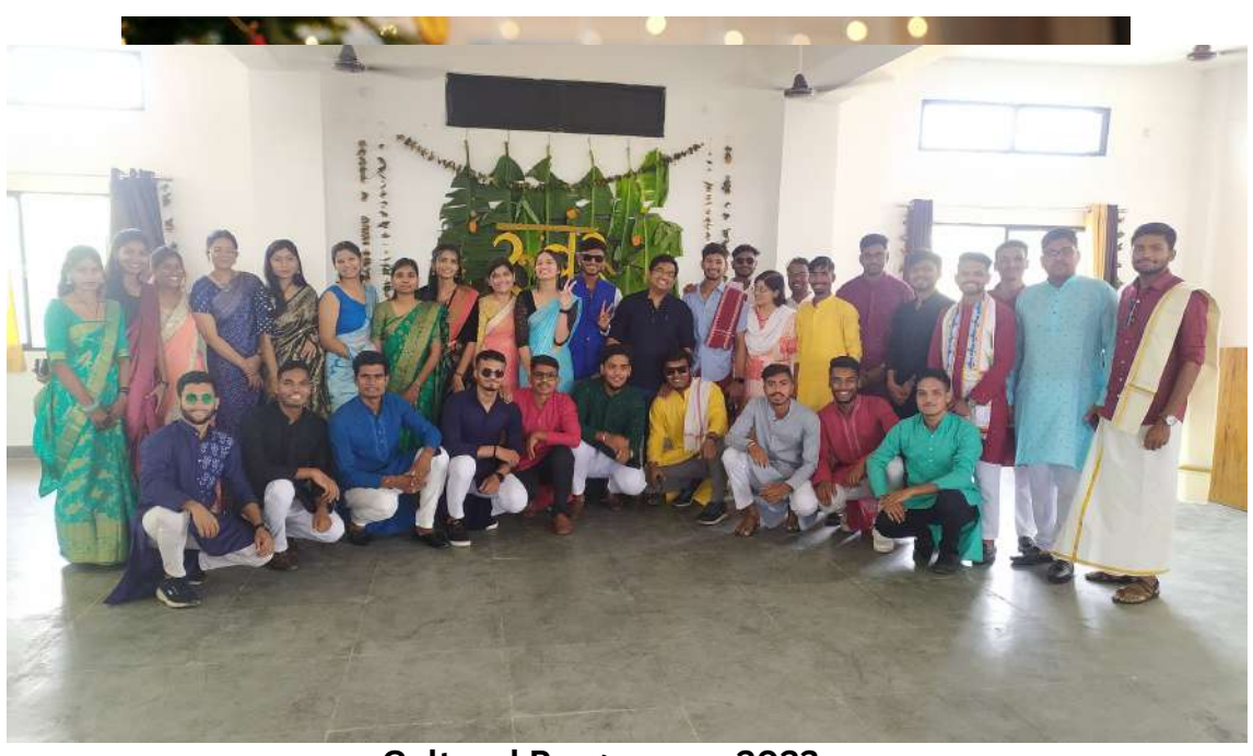
Cultural Programme 2023