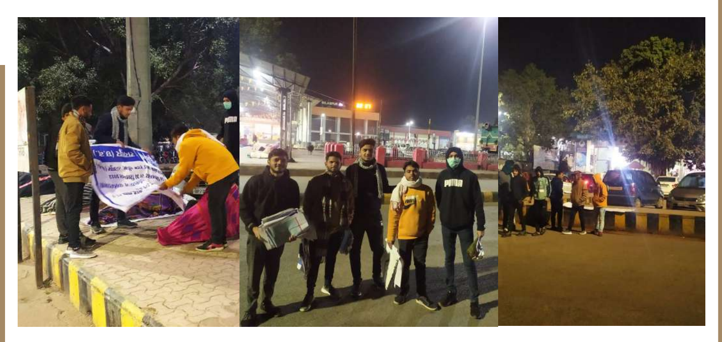
Students Initiative: Helping Hand, students distributed the used flex banner to homeless people at midnight near Railway station.