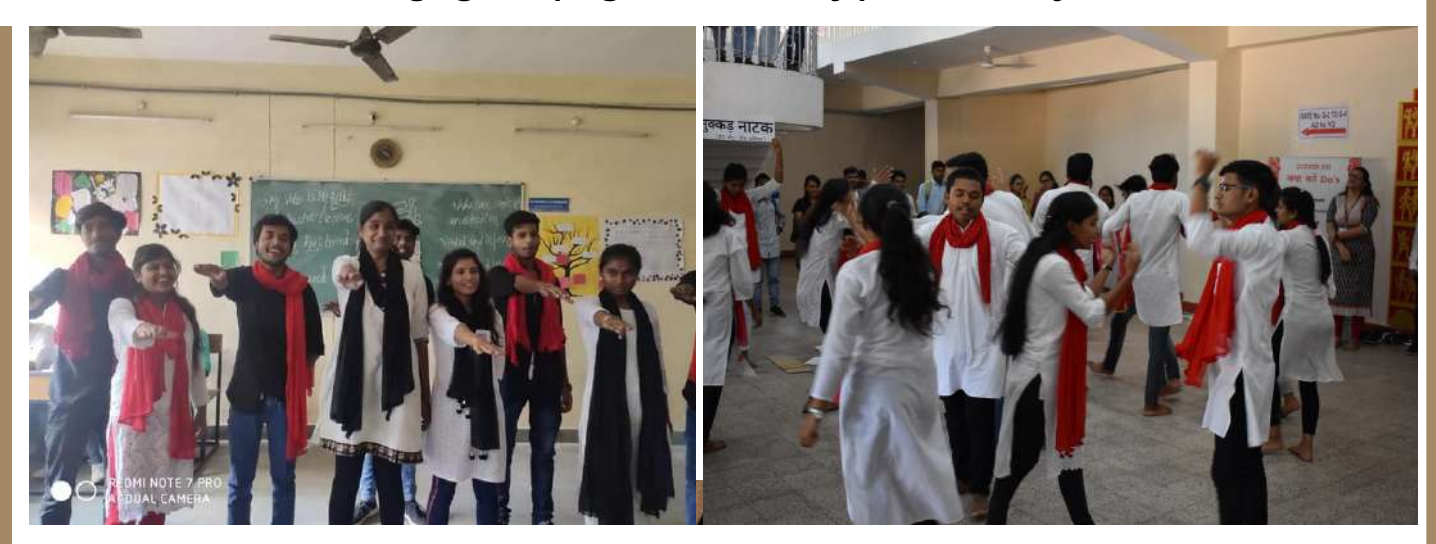
Student Performing Nukkad Natak during Electoral Literacy Festival