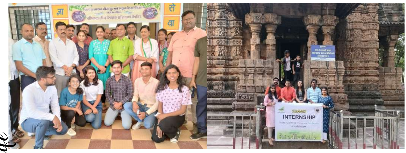
Summer Internship with Bijapur District Administration,