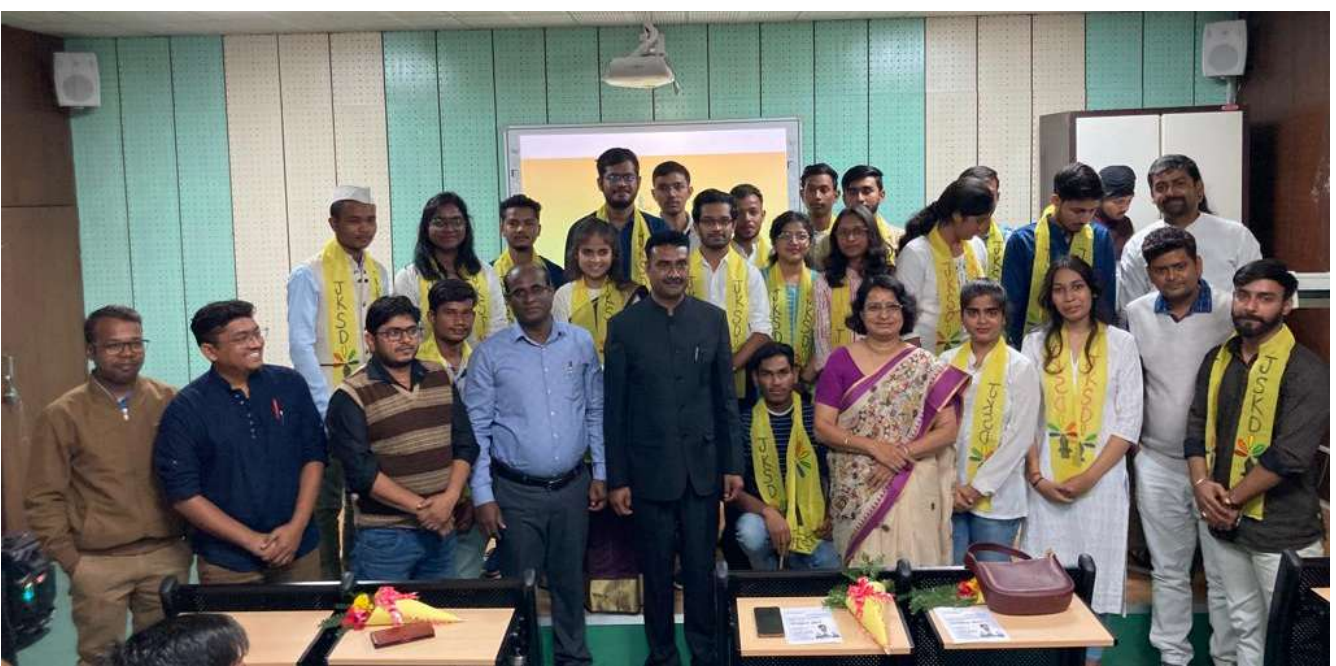
Election Managing Compaign class activity performed by Students