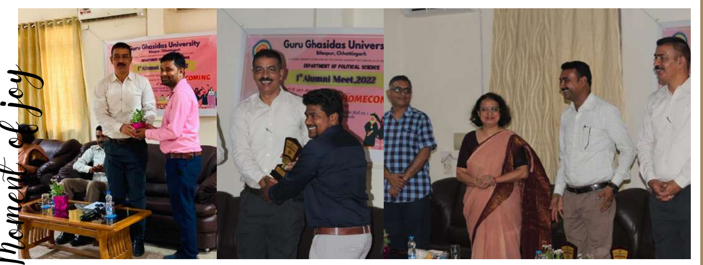
Alumni Meet 2022