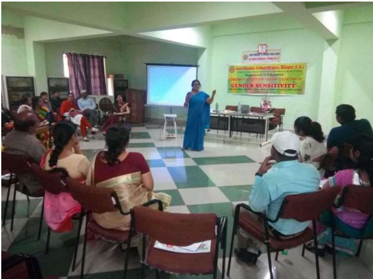
Resource person interacting with participants

This program on 'Gender Sensitivity' is addressed to teacher educators in the education system who play a key role in forming, and shaping the lives of children and youth, besides being/becoming highly influential persons with potential to effect changes in attitudes and behavior in their spheres.