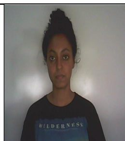
Test Day Photo