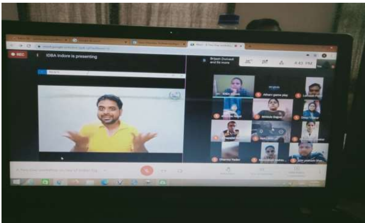
Image of Activities of the Workshop

Head Department of Education Turu Ghasidas Vasthavidyalaya Bilaspur (C.G.)