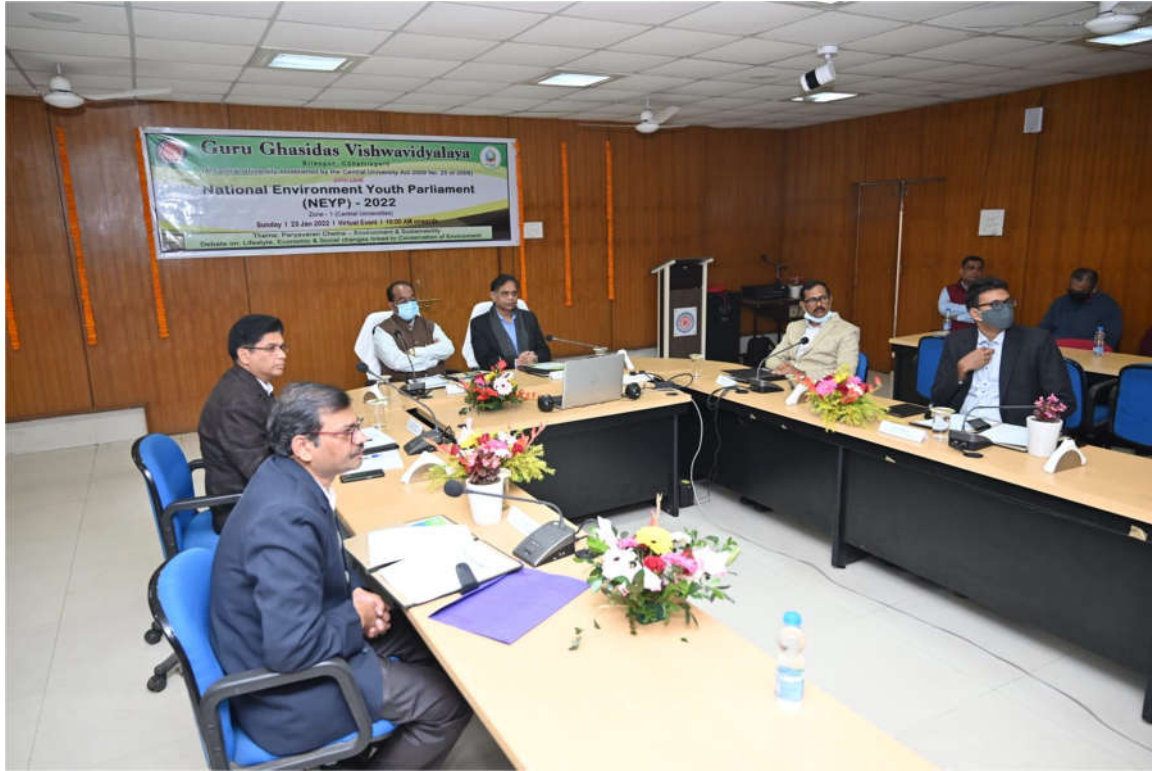
Honorable Judges listening the view of participating students on NEYP 2022