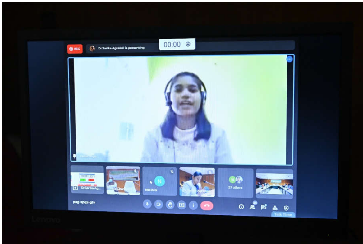
Participants presenting online during NEYP 2022