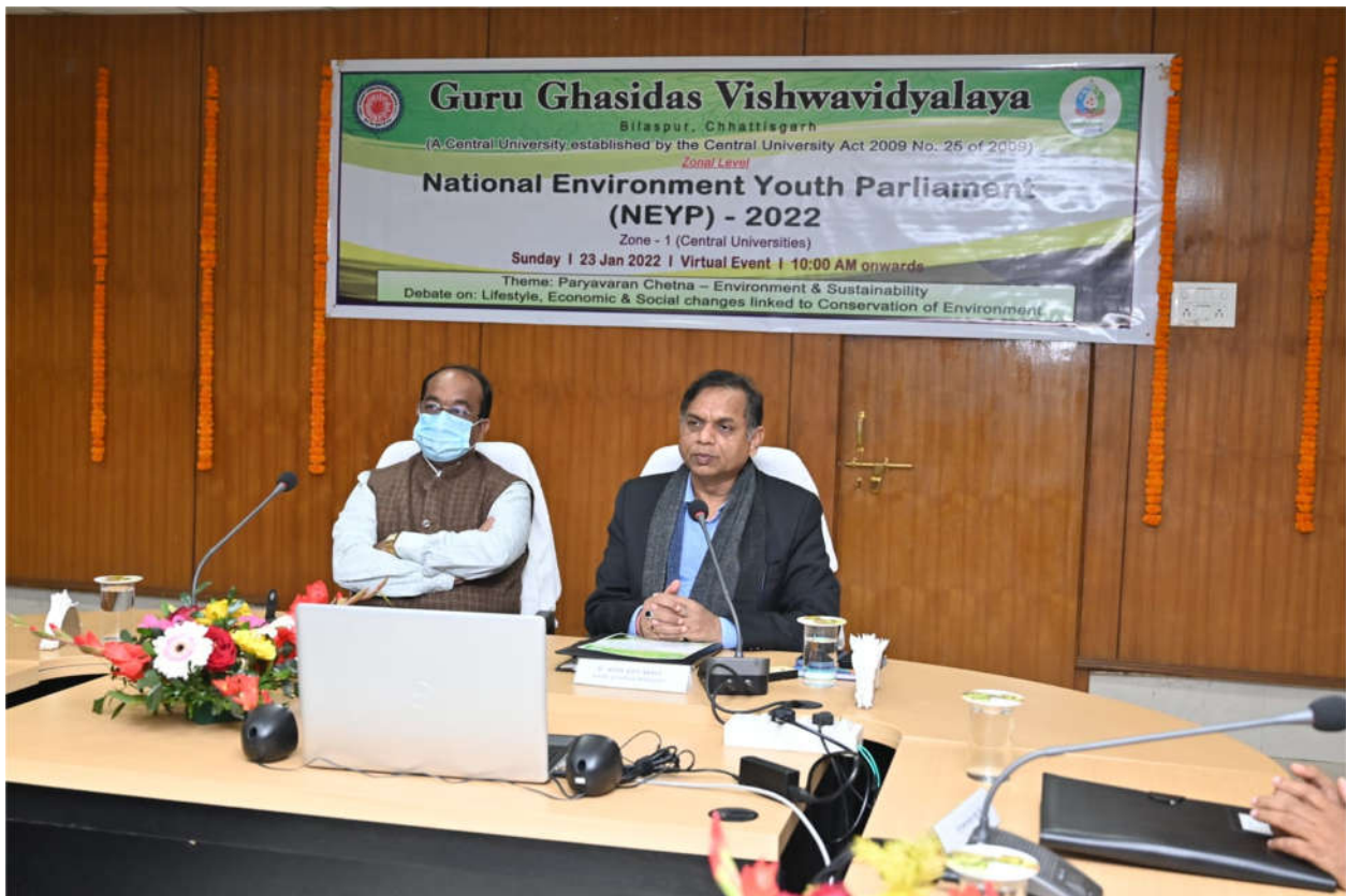
Judging the participants during NEYP Competition 23 January 2022