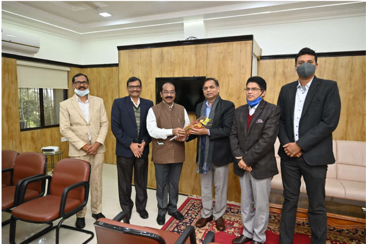
Welcoming of Jury Members by Vice Chancellor, GGV