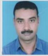
Dean School of Social Sciences