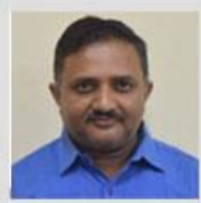
Dean School of Engineering and Technology