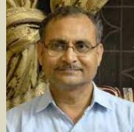
Dean School of Physical Sciences