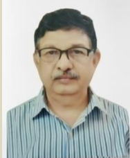
Dean School of Education