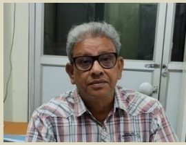
Dean School of Arts