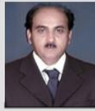
Dean School of Management and Commerce