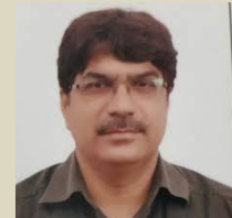
Controller of Examinations