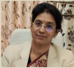
Dean School of Life Sciences