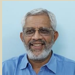
Dean School of Mathematical and Computational Science