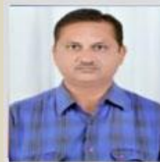
Dean School of Interdisciplinary Education and Research