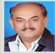
Dean School of Natural Sciences