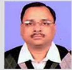
Dean School of Law