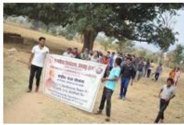
Rally in the village-1