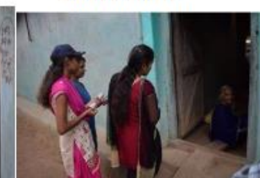
Afternoon Survey in village-2