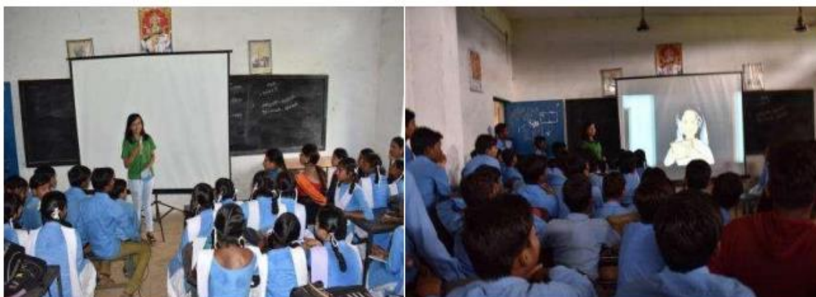
Movie screening in primary schools