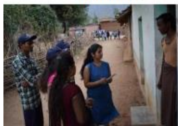
Afternoon Survey in village-1