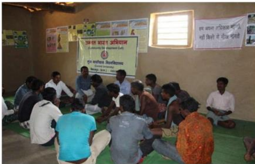
Meeting of UBA volunteers with the villagers held at village Lalmatipara of Rigwar Gram panchayat on 26.03.2022 on water conservation and government initiatives

Some of the activities conducted in this academic session are group meeting for water conservation Awareness, National symposium cum workshop on Biodiversity, National Seminar - Environmental Conservation & human life, workshop on sustainability & its enterpreneurial approach, world soil day etc.