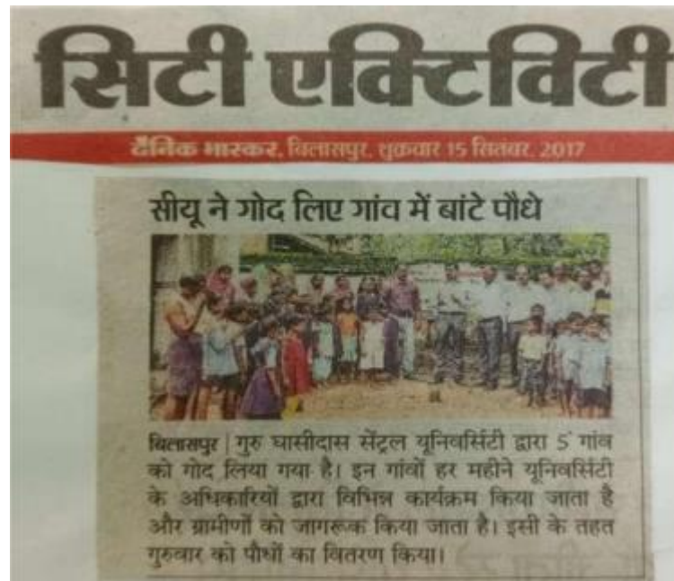
Dainik Bhaskar newspaper date 15.09.2017

cleanliness etc., in nearby villages and adopted villages under Unnat Bharat Abhiyaan (UBA). The activities were carried out by NSS, UBA, student and faculty volunteers.