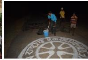
Camp Site decoration