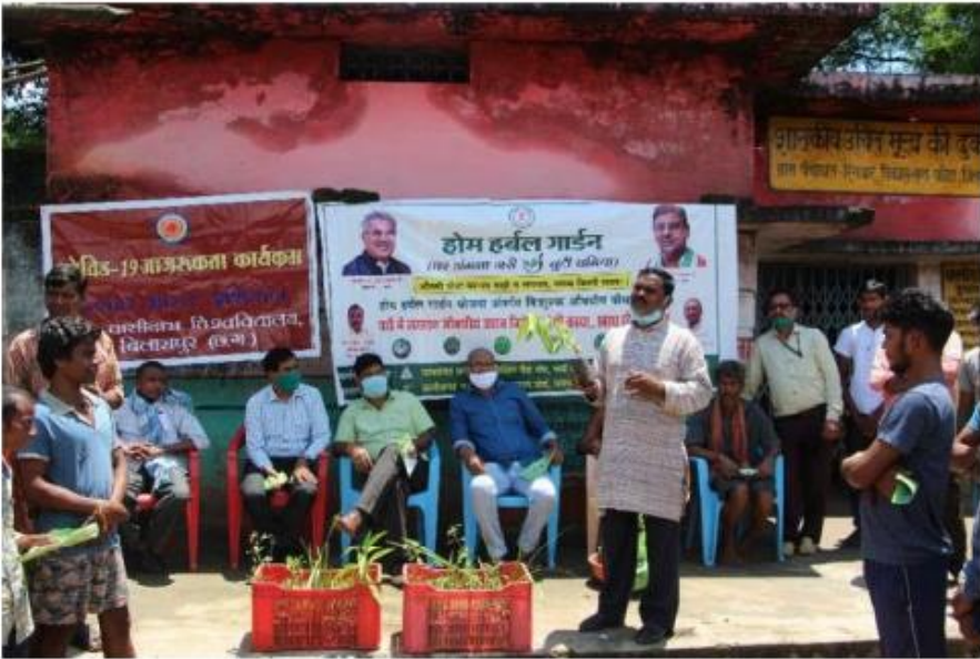
Resource person talk on Medicinal plants use and propagation at Rigwar gram panchayat on 30.08.2020.

Not many number of activities were conducted in this academic session due to COVID – 19 pandemic but some of the activities conducted in this academic session are Medicinal plant use and gardening for protection against Covid and other diseases, Training and Awareness program on crop diversification and high yielding crops, Plantation Activity & Earthen pot distribution. The activities were carried out by NSS units, UBA team, students and faculty volunteers.