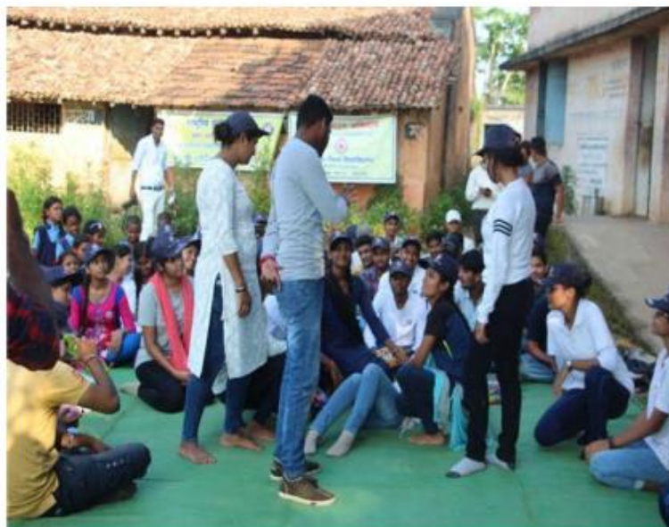
Nukkad natak play conducted to aware rural students and villagers on abuse of alcohol drinking and health problems, village Swachhta and our responsibility on 2.10.2019

A number of activities were conducted in this academic session among which the main activities are awareness on environmental conservation and plantation, rural swachhta, painting competition on swachhta hi seva, wall slogan writing for giving environmental protection message, plastic ban campaign, pledge activity for cleanliness of water bodies etc. The activities were carried out by NSS units, UBA team, students and faculty volunteers.