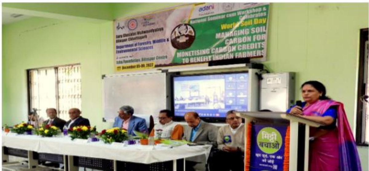
National Seminar cum Workshop on Managing Soil Carbon for Monetising Carbon Credits to Benefit Indian Farmers