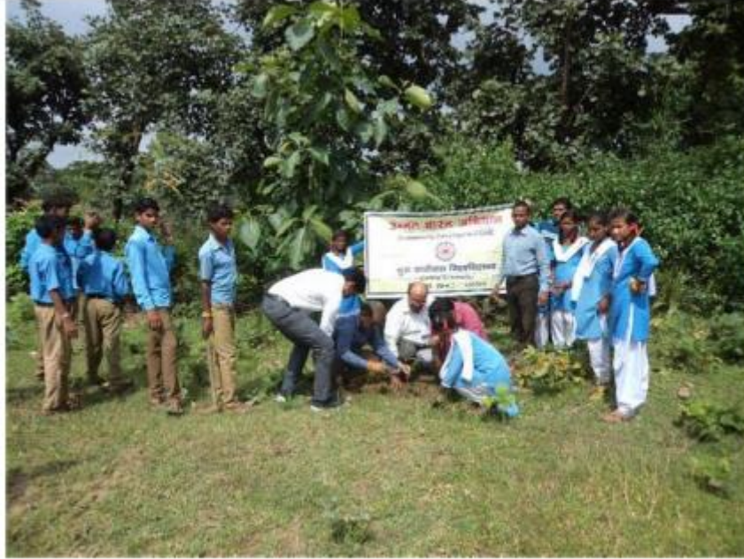
Plantation of saplings during awareness program on environmental conservation and plantation at high school premises village Umariadadar, Bilaspur on 16.07.2019