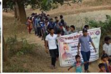
Rally in the village-2