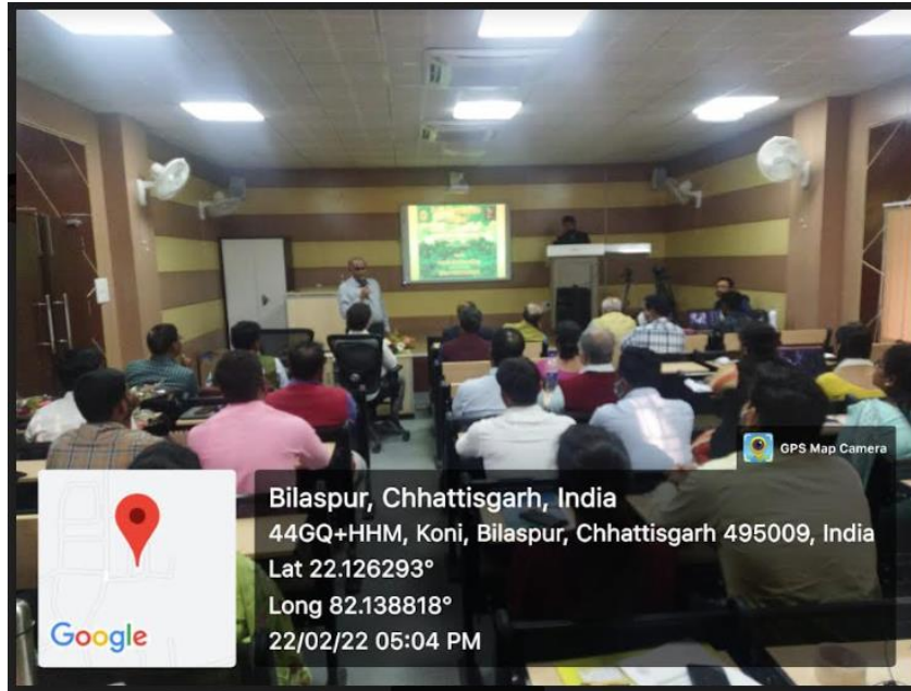
National symposium cum workshop on Biodiversity