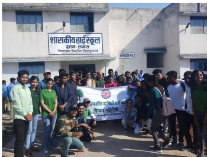
Plantation program at Govt. High School Lagra, Bilha, Bilaspur

The main activities taken up in this academic session were Shramdaan in different nearby villages, UBA adopted villages, Farmers awareness program on crop diversification, Mushroom cultivation training for rural income and livelihood, Environmental conservation through plantation, Awareness program on rural swachhta, health and hygiene, Painting activity for Awareness on Environment and Hand washing and sanghoshti activity for cleanliness. The activities were carried out by NSS, UBA, student and faculty volunteers. Also, a plantation program was organized on 12.02.2019 at Govt. high school Lagra. In this program 40 students of B.Sc. Forestry 8th semester participated to make aware rural students on plantation techniques and its conservation. During the program 50 saplings of forest species namely Aonla, Neem, Mango and Maulshree etc were planted in the school campus.