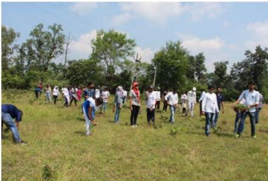
Cleaning activities organized during Swachh hi seva awareness program held at village Rigwar on 25.09.2019