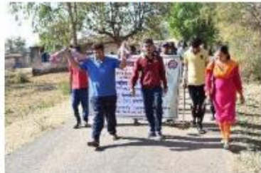
Going for 'Shramdaan'