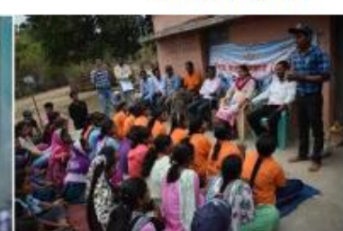
Meeting with Swachch Bharat Mission

Shramdaan & Environment awareness activity in village Tendubhata, Kota, Bilaspur