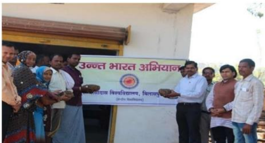
Distribution of seed material of Elephant foot yam (Jimikand) during farmer awareness program at village Pachra