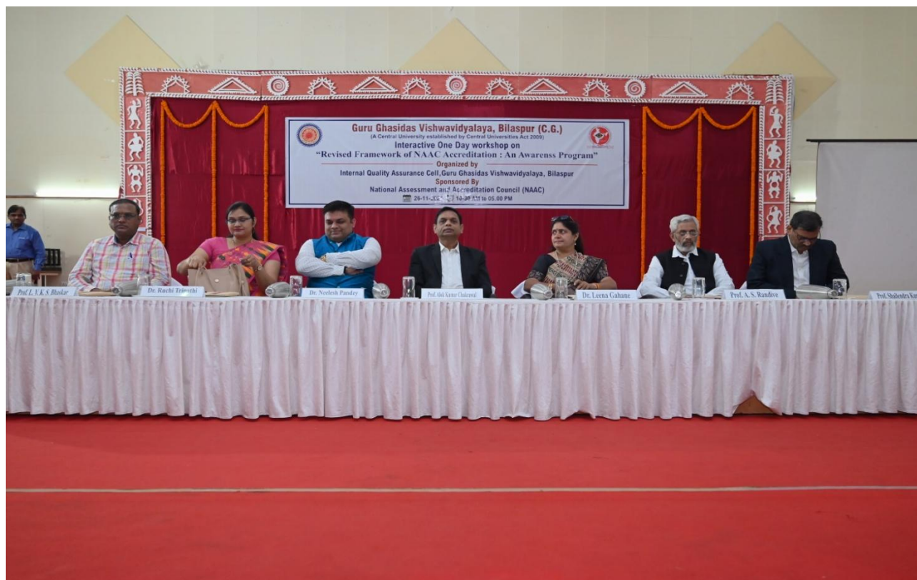
Inauguration of the workshop