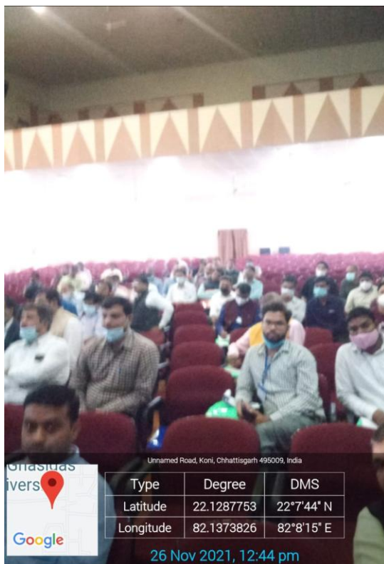
Audience attending offline mode